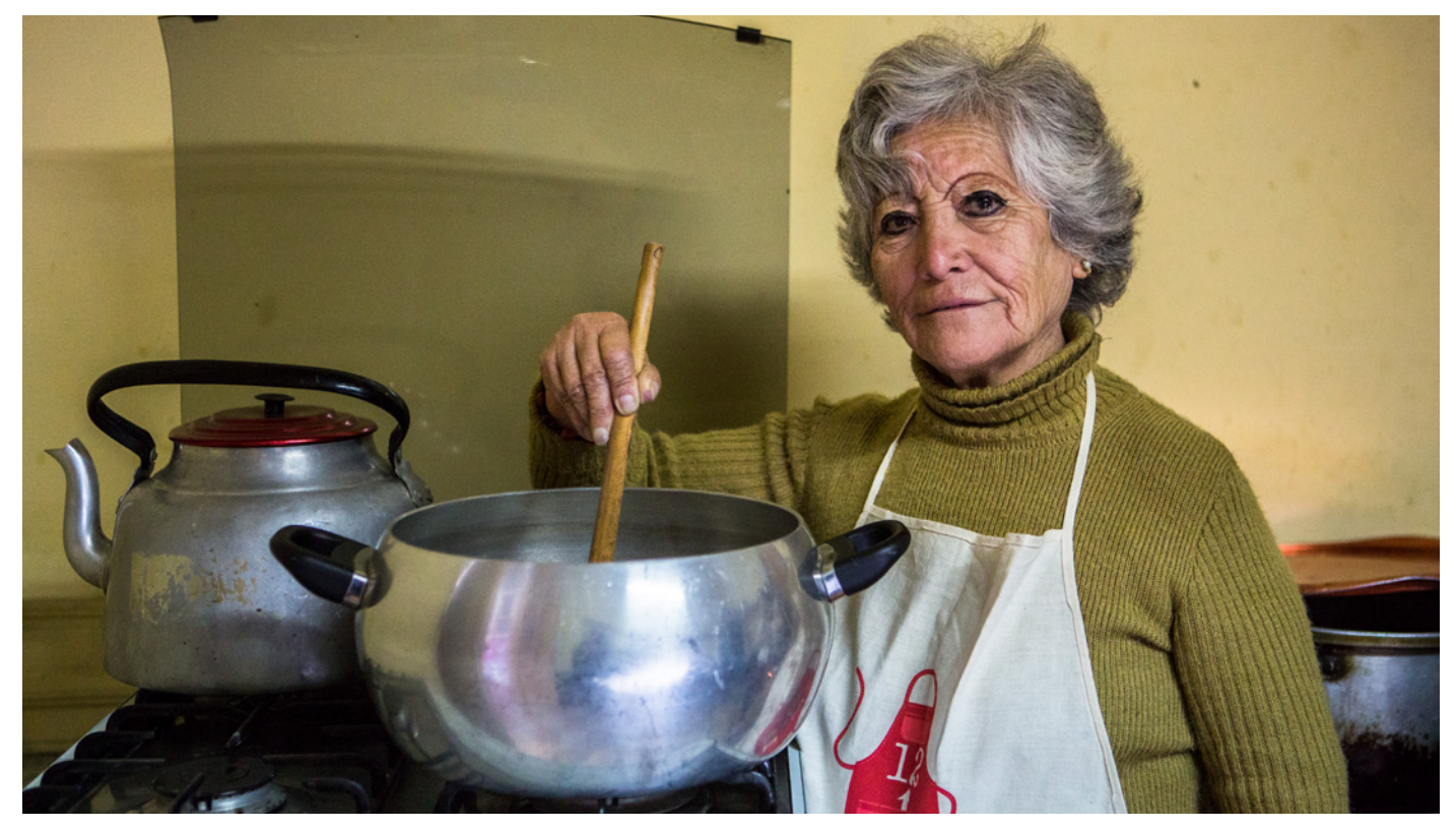
Workplaces, such as private homes, leave women susceptible to violence due to isolation and a lack of access to complaint and legal recourse mechanisms.

to public spaces and the use of public natural resources. Private homes in which home-based workers and domestic workers operate are considered high-risk workplaces due to the isolation of these workers (ILO 2016: para 14).