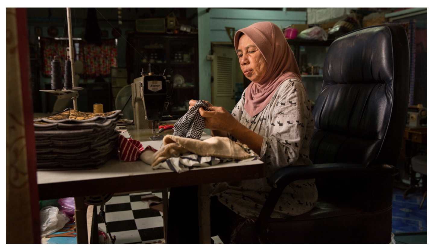
Home-based workers are vulnerable to contractors who may refuse to pay a decent rate, delay or withhold payments and subject women workers to psychological violence.

It requires a more integrated approach that draws on the resources of not only labour inspectorates, but numerous government entities at all levels, incorporating in particular the municipal authorities who control many informal places of work and owners of capital that influence how public space is used. It must also look beyond labour law to incorporate other areas of law that can more easily provide legal protections to informal workers (for example administrative law and municipal by-laws).