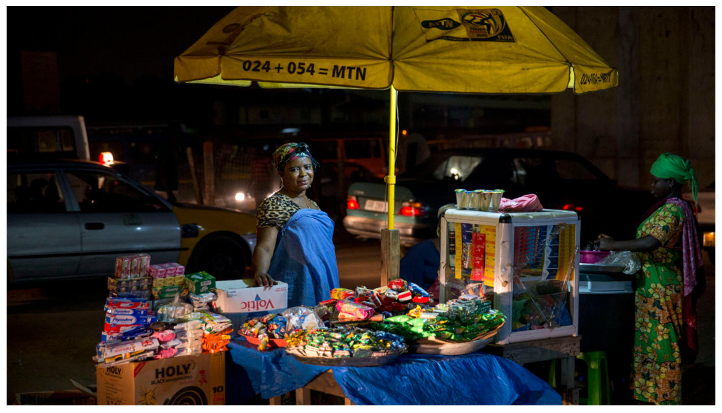
Work-related violence can come from a number of sources, most prominently: the state, fellow workers, household members, the public and/or users of the service provided by the informal worker, criminal actors, and powerful vested interests.

dispute mechanisms or benefit from labour inspections. Strengthening regulatory frameworks to prevent gender-based violence in the world of work must include measures to strengthen women's access to justice in cases of physical, sexual and psychological violence experienced at the hands of state officials, criminal actors, employers, household members, fellow workers, and consumers.