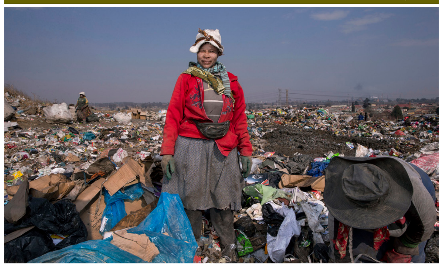
All informal workers are likely to experience violence due to their status in employment and lack of protection. Women informal workers are more vulnerable to gender-based violence due to the intersection of their gender and insecure working conditions.